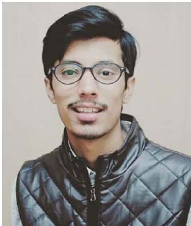
Science & Eng